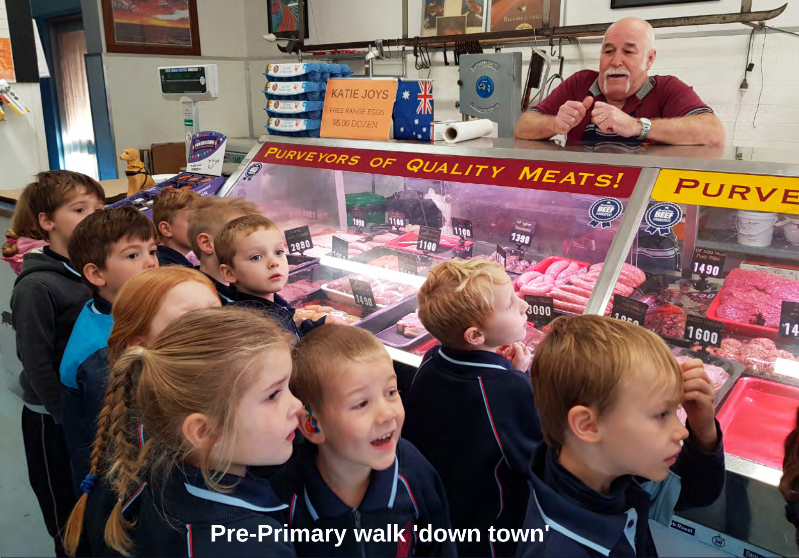
Pre-Primary walk 'down town'