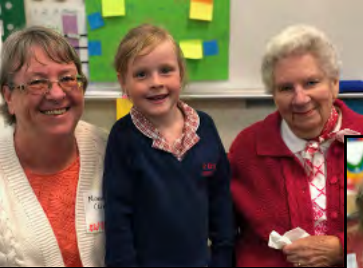
Grandparents 'afternoon tea' in Year One