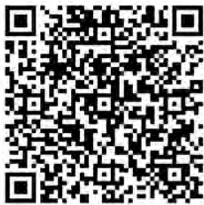
School Yearbook Community Survey

Parents, we would love to know your thoughts about our school Year Book. Below is a QR code which will ask you 4 questions. A staff committee is responsible for producing this annual and we would like feedback from our school community. Thank you in advance for completing this.