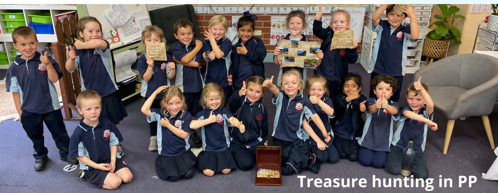
Treasure hunting in PP