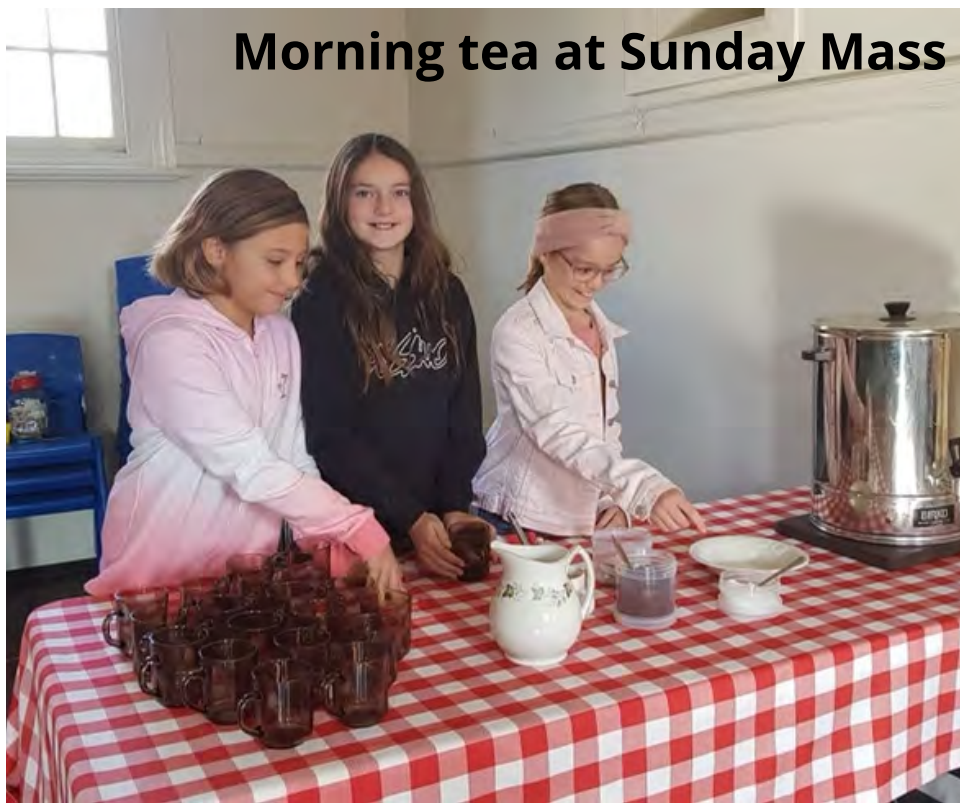
Morning tea at Sunday Mass